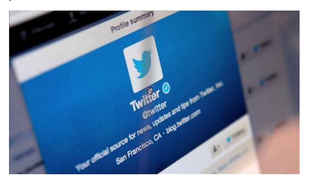
Twitter set its price range for its initial public offering at $17 to $20 a share, in a deal that values the company at up to $11.1 billion. WSJ's IPO reporter Telis Demos reports.

Analysts said the company might yet raise the target price. If the offering is well received, it could signal that investors are willing to wager on a big future for social-media companies even in the absence of profits, which Twitter doesn't have. The deal comes amid the best year for U.S.-listed IPOs since 2007 based on number of deals.