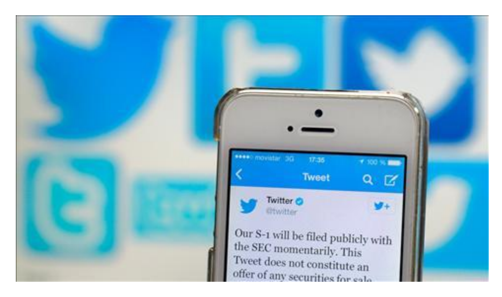
Twitter plans to set IPO price range in the next day or two. Pinterest's latest valuation is now $3.8 billion. Brace for holiday airfare turbulence. Joanne Po reports.

http://live.wsj.com/video/twitter-to-set-ipo-range-this-week-and-more/4518394E-6F9E-4348-8C9C-6A0B7B7BB9DD.html